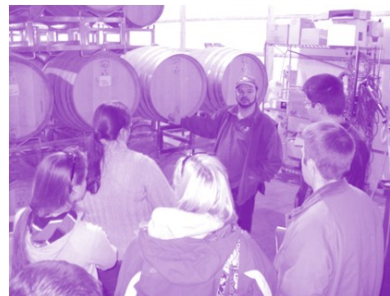
Climatology of vineyards.

"I'm interested in meteorology but I don't plan to pursue a career focused on it."